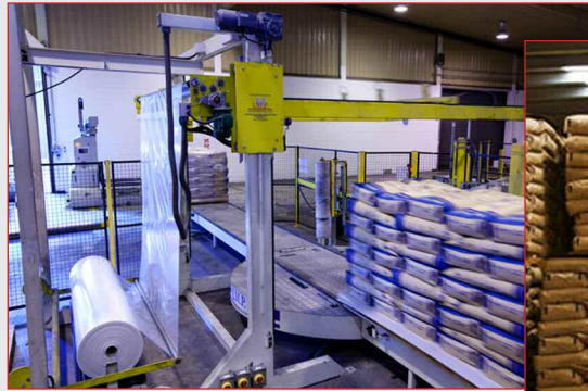
Clockwise from above: powder milk being bagged. . . . Milk powder stored in a warehouse in California, US.

In the evaporator, the preheated milk is concentrated in stages or “effects” from around 9.0% total solids content for skim milk and 13% for whole milk, up to 45-52% total solids. This is achieved by boiling the milk under a vacuum at temperatures below 72 °C in a falling film on the inside of vertical tubes, and removing the water as vapor. This vapor, which may be mechanically or thermally compressed, is then used to heat the milk in the next effect of the evaporator which may be operated at a lower pressure and temperature than the preceding effect. Modern plants may have up to seven effects for maximum energy efficiency. More than 85% of the water in the milk may be removed in the evaporator. Evaporators are extremely noisy because of the large quantity of water vapor travelling at very high speeds inside the tubes.