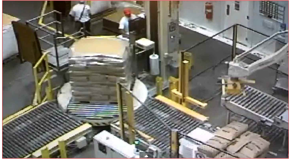
Milk powder processing plant.

In most cases two probes are installed on each dryer. One is installed on the inlet and one on the outlet exhaust. The relative humidity and temperature measurement will then be used to balance the dryer for optimum drying, thus reducing energy costs.